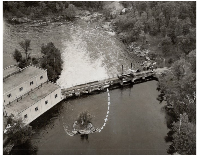
View from above the millpond, showing where the boat struck and where the occupants were swept away by the current.

In 1942, six visitors from Toronto were swept over Wasdell Falls when their powerboat capsized on some rocks in the millpond. Two adults and two children were drowned on the rocks below.